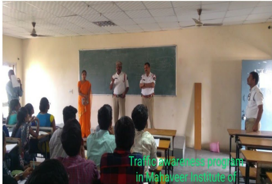
Traffic awareness program in Mahaveer Institute of science and Technology campus on 5-03-20